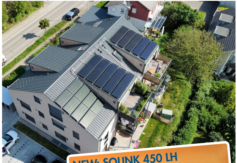
Apartment building with 6 flats and a 17 kW heat pump near Freiburg, Germany