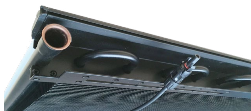
SOLINK - electricity and heat from one collector / module

The large air heat exchanger reduces the module temperature compared to standard PV modules with and without heat pump operation. Approximately 6 - 10% higher output yield and a reduced maximum module temperature lead to a long service life. SOLINK has been tried and tested since the winter of 2016/17 and is based on a precursor development that has been in use since 2014.