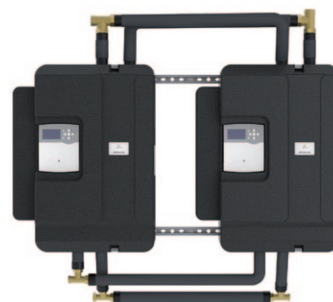
Cascade set for RATIOfresh 500 / 810