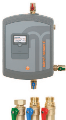
tubra ball valve set for storage and DHW connections, 3 pcs.