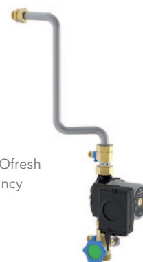
Re-circulation set for RATIOfresh 500 / 810 with high efficiency circulation pump