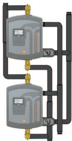
tubra cascade set for hydraulic connection of two tubra nemux S stations