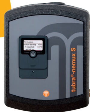
tubra nemux S

The RATIOfresh and tubra nemux S freshwater units prepares hot water only when needed. This is solar hot water generation of the future - hygienic and demand based.