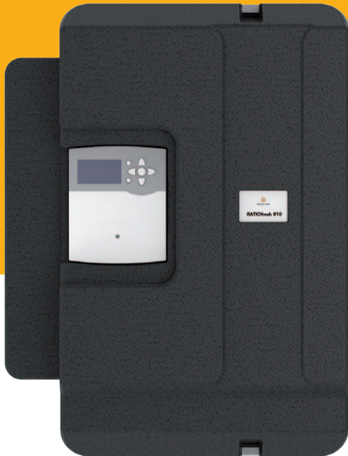
RATIOfresh 500 / 810

ENERGIETECHNIK ENERGY TECHNOLOGY TECHNOLOGIE ÉNERGÉTIQUE ENERGIETECHNIEK