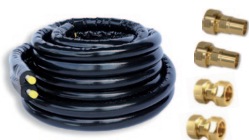
Rapid piping system TWINflex