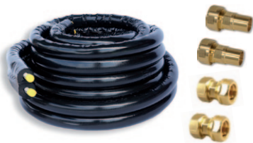
Rapid piping system TWINflex