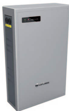
Lithium-Ion battery highly efficient and long-lasting

Highly efficient lithium-ion and lead-gel batteries or, respectively, our environment friendly salt water batteries, store solar power and make it available as needed, independent of momentary weather and daytime.